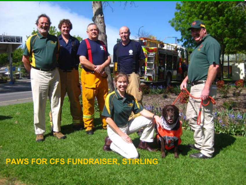
PAWS FOR CFS FUNDRAISER, STIRLING

Skype is free to download, and if you need help to set up, email us at info@savem.org.au and we arrange for the webmaster to assist you.